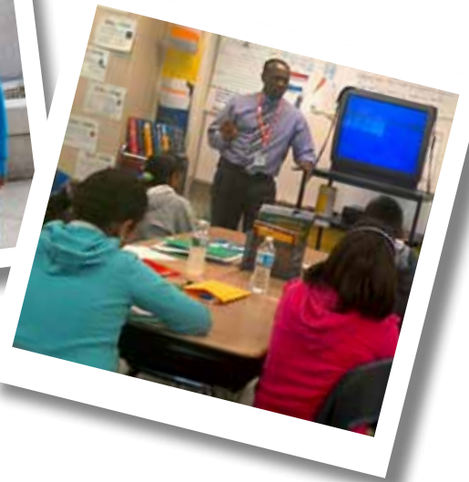
PMUA & students from Barack Obama Green Charter High School filled numerous bags of litter cleaning up Library Park.